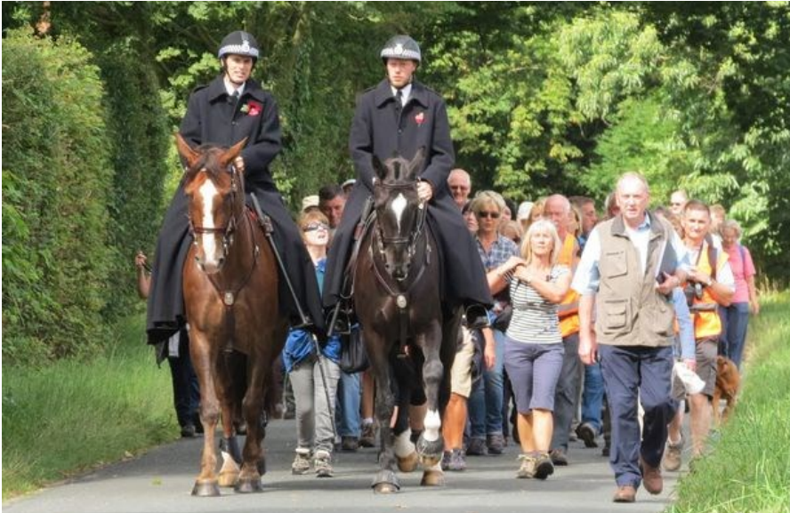
Two police horses lead the walkers on the new War Horse Walk