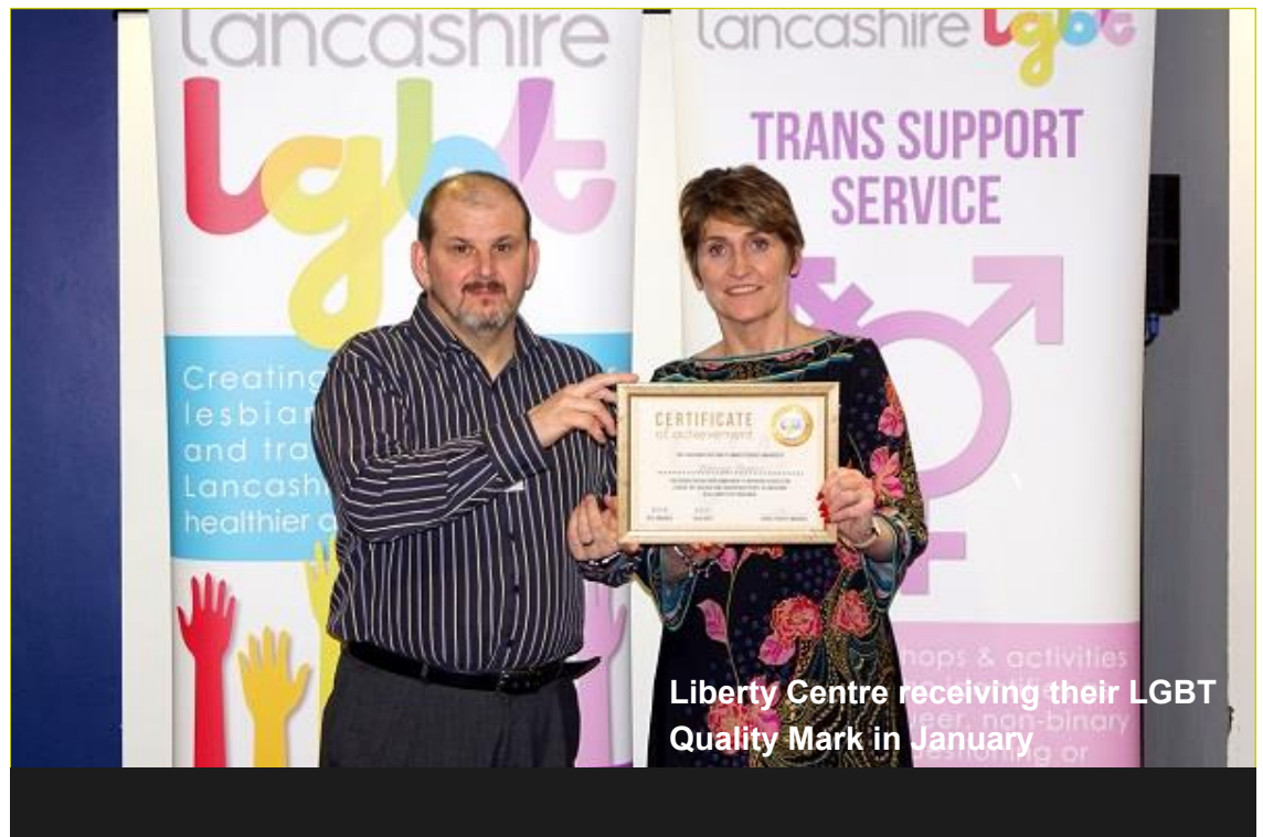
Liberty Centre receiving their LGBT Quality Mark in January